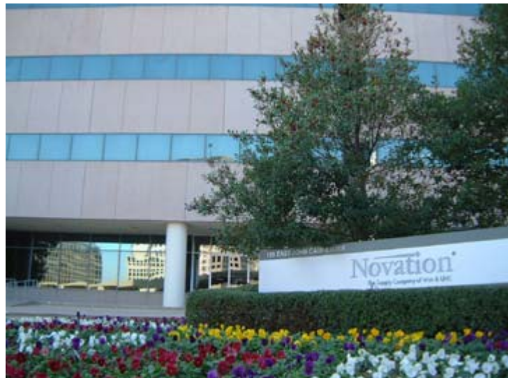
Novation claims it saves member hospitals $1 billion a year.

Nonetheless, its developer says the software could save healthcare consumers in this country up to $80 billion a year. But when the software company went looking for funding to launch a business based on the new system, the bank turned it down for what seemed like bizarre reasons. Perhaps a more