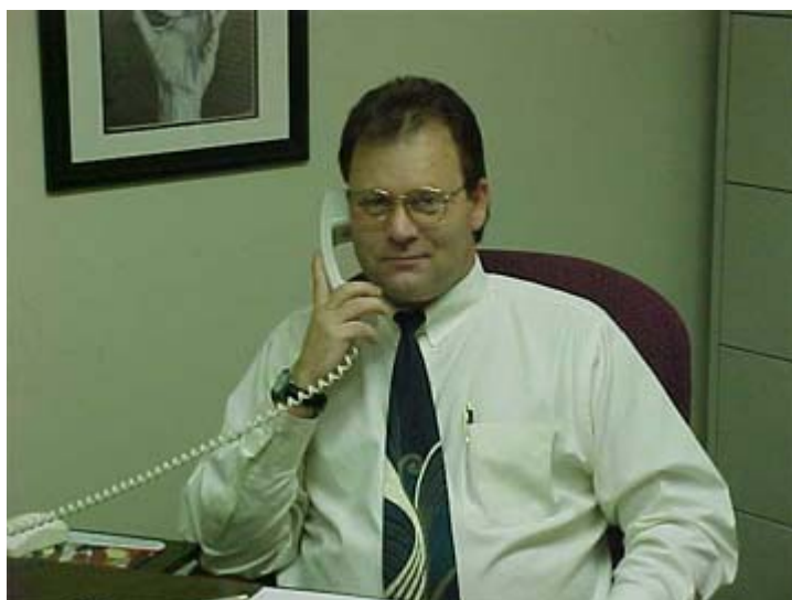
Lipari: 'They're keeping us out of the market. There's a vast number of companies ... that Novation's monopoly is doing this to.'

plausible explanation: The bank had a business relationship with an investment firm closely tied to a giant hospital supply entity, one that controls close to a third of all the hospital supply business in the United States — and that stood to lose hugely by the introduction of such software.