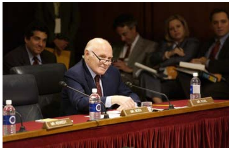
U.S. Sen. Herb Kohl of Wisconsin co-authored legislation that would have strictly regulated GPOs like Novation.